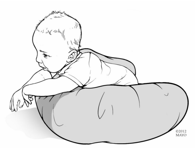
Tummy time on pillow or Boppy®