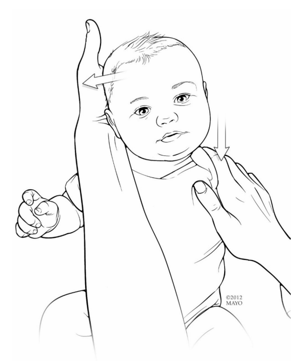
Torticollis stretching tilt for left side