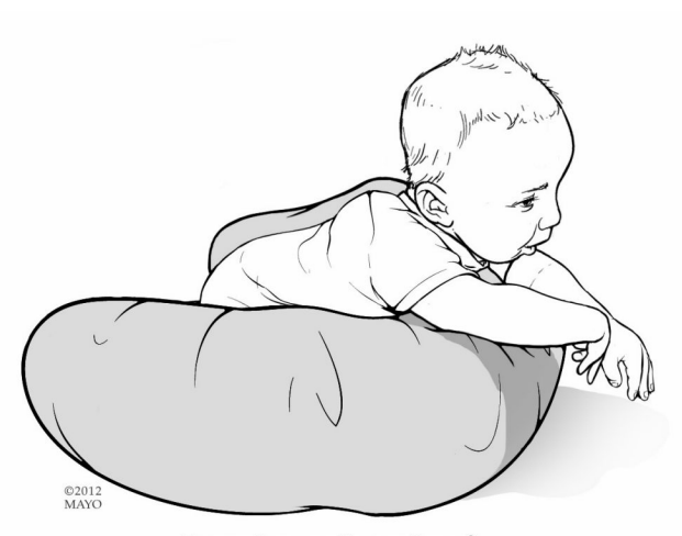
Tummy time on pillow or Boppy®